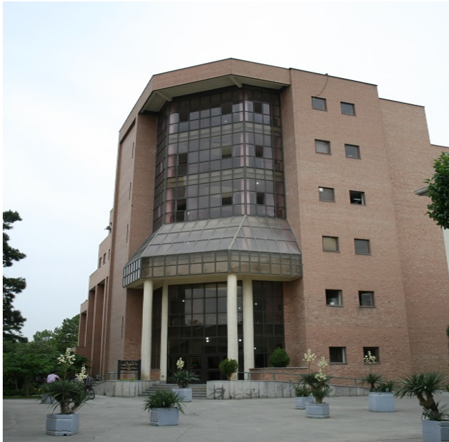
Department of Physics