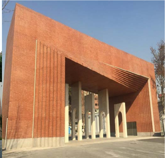
Sharif University of Technology (Southern Gate, Azadi Avenue)